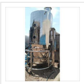
Fluid Bed Dryer