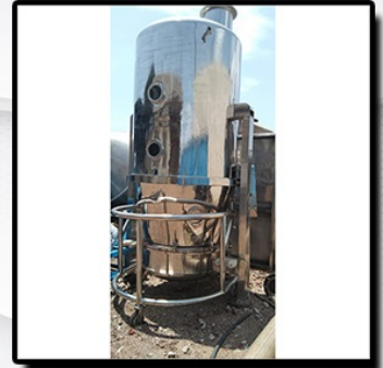
FLUID BED DRYER

Agitated Nutsche Filter Dryer, Cone Blender, Fluid Bed Dryer, For Point Suspension Centrifuge, Glass Lined Reactor, High Pressure Reactor, Industrial Condenser, MS Storage Tank, Mass Mixer, Mixing Tank, Octagonal Blender, PP Plate Filter Press, Rapid Mixer Granulator, Ribbon Blender, Rotary Cone Vacuum Dryer, etc.