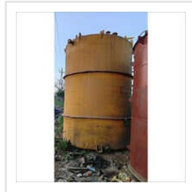
MS Storage Tank