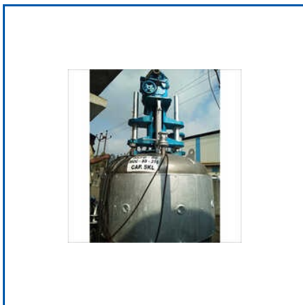
AGITATED NUTSCHE FILTER DRYER

Agitated Nutsche Filter Dryer, Cone Blender, Fluid Bed Dryer, For Point Suspension Centrifuge, Glass Lined Reactor, High Pressure Reactor, Industrial Condenser, MS Storage Tank, Mass Mixer, Mixing Tank, Octagonal Blender, PP Plate Filter Press, Rapid Mixer Granulator, Ribbon Blender, Rotary Cone Vacuum Dryer, etc.