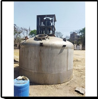
AGITATED NUTSCHE FILTER