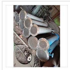
Shell And Tube Heat Exchanger