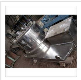
For Point Suspension Centrifuge