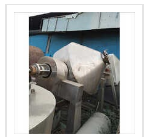
Rotocone Vacuum Dryer