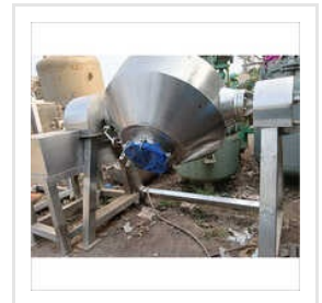
Rotary Cone Vacuum Dryer