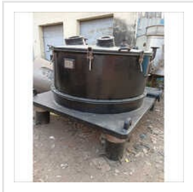
Rubber Lined Centrifuge