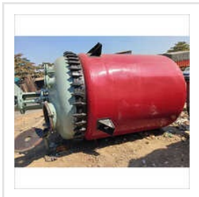
Glass Lined Reactor