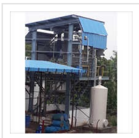
High Pressure Reactor