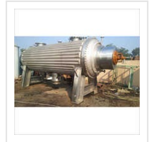
Rotary Vacuum Paddle Dryer