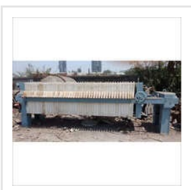
PP Plate Filter Press