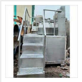
Rapid Mixer Granulator